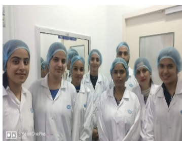
Group photo during plant visit.....