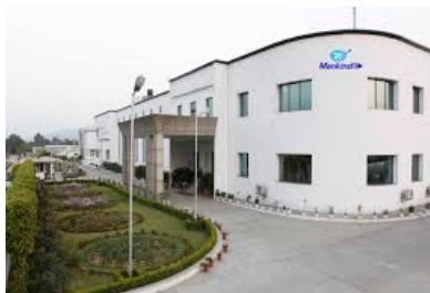
Mankind Pharma (P) Ltd. Industry, Ponta Sahib, Sirmour, HP