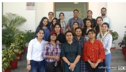
Group photo with HR Manager (Mankind Pharma)