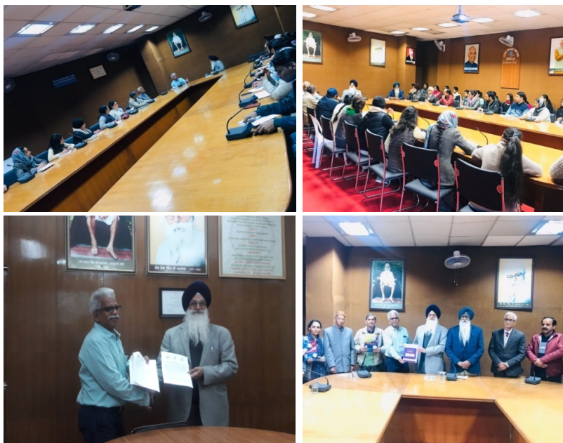
Workshop Activity Photographs