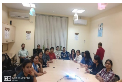
Introduction lecture in conference hall

On 12 th October, 2019, 12 students of UG and PG of Department of Economics along with 3 faculty members of ACECM visited Mankind Pharma (P) Ltd. Industry and Nanz Med Science Pharma (P) Ltd. Industry, Paonta Sahib, Sirmour, HP. The main objective behind the visit was to make students aware about pharma companies, working environment of industry and their marketing strategies.