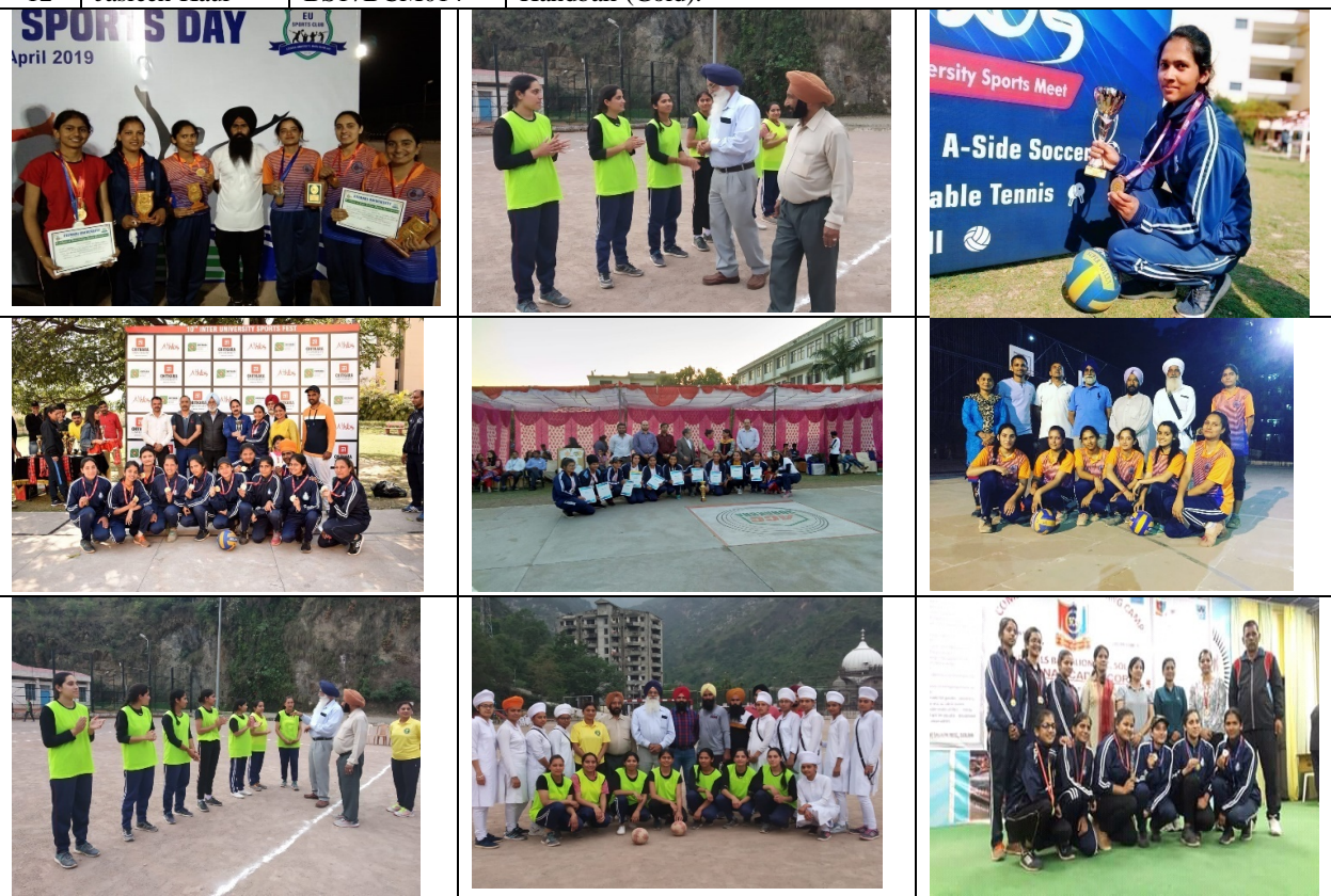
Sports Activities March 5, 2020- Photographs