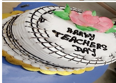
Glimpses of Teacher’s Day